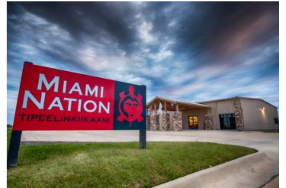
Miami Nation sign located at tribal headquarters.

In our language, the Miami Tribe's name for ourselves is Myaamia, which means “the Downstream People.” Our story begins at a place we call Saakiiweeyonki, near where the St. Joseph's River empties into Lake