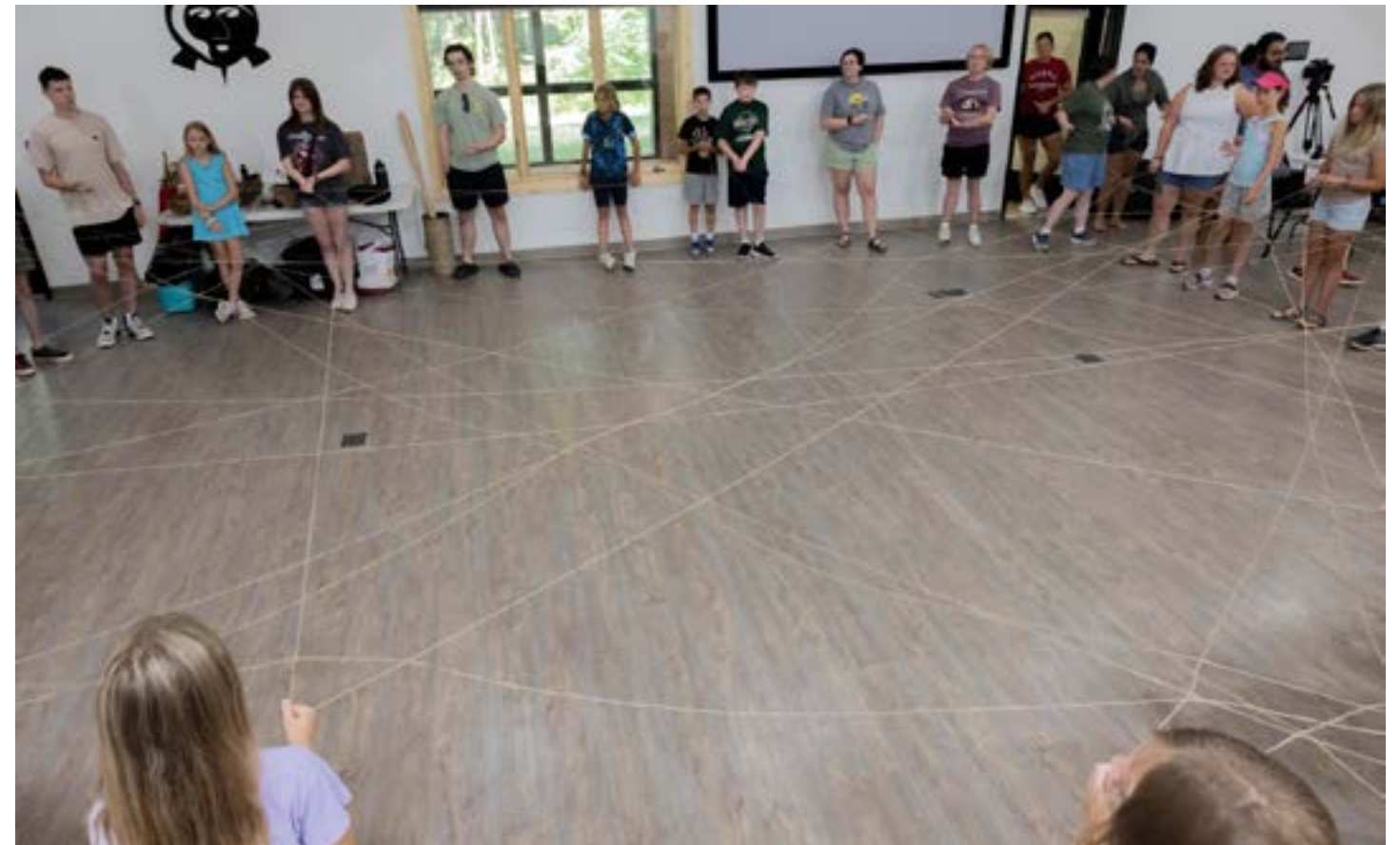
Activity during summer programs.